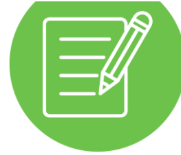
News, Articles & Family Stories