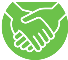
Request a Peer Mentor