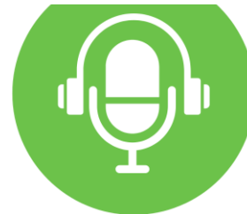
NICU Babies, Parent Support Podcast